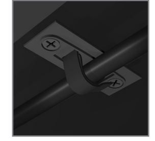
Secure ETL-listed cords under table tops using hook and loop strips.

168 North Main Street • PO Box 187 • Northfield, VT 05663 • T. 802.278.5800 • www.wallgoldfinger.com